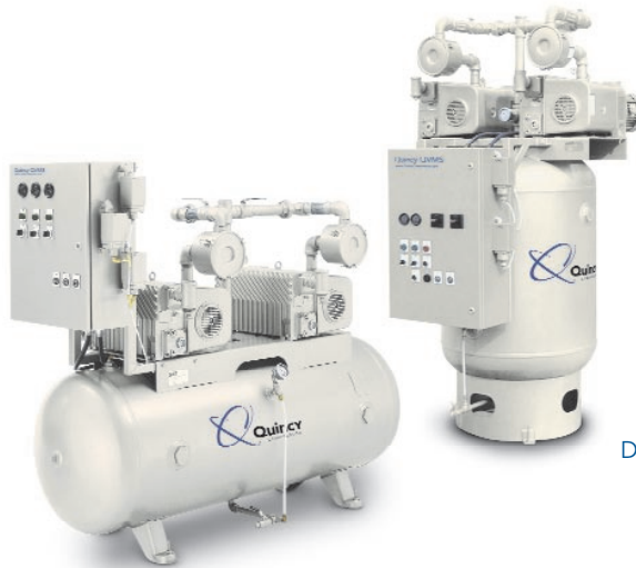
Duplex tank-mounted Quincy QV-MS Vacuum