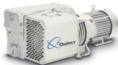
Simple, direct-drive pumps with built in separation and cooling

The Quincy QV-MS Rotary Vane Vacuum Medical System has been uniquely designed to meet your medical vacuum requirements. Engineered for flexibility and easy installation, the Quincy QV-MS features reliable, direct drive pumps and one-side access for necessary maintenance. And of course every component of the Quincy QV-MS is NFPA 99 compliant.